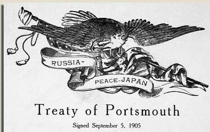
Treaty postcard.

This international negotiation settled immediate difficulties in the Far East and created four decades of peace between the two warring nations. The Portsmouth Peace Treaty process of formal negotiations between Russian and Japanese delegates, the behind the scenes back channel diplomacy of Roosevelt, the hosting of the negotiations by the State of New Hampshire and the U.S. Navy, and the informal encouragement and activities of the local people provides a unique example of a multi-track diplomacy process for peace. On the one hundredth anniversary of the Treaty of Portsmouth, we look back on this unusual event, its impact on world history, and its example for diplomacy today.