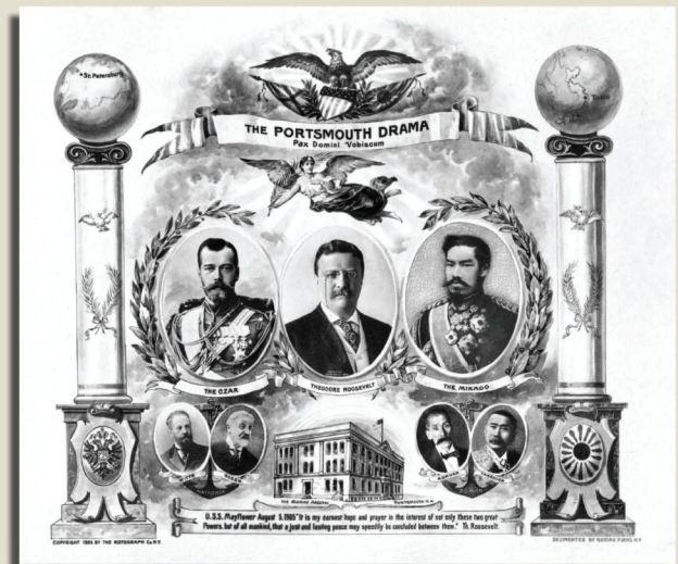
Many postcards were published during the treaty negotiations; this one has all of the major participants pictured.