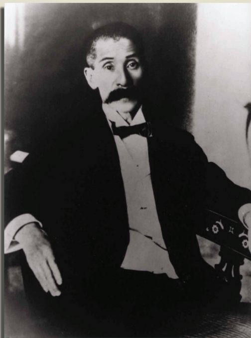
Baron Komura.

Jutaro Komura spearheaded the Japanese alliance with England after Japan failed to reach an agreement with Russia on Manchuria and Korea. He also represented Japan as Foreign Minister throughout the war. A Harvard Law School graduate, Komura was an experienced and determined statesman who had served as minister to Seoul, Beijing, Washington and St. Petersburg.