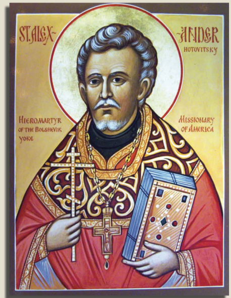
Icon of St. Alexander.

St. Alexander was martyred by the Bolsheviks. Father Alexander Hotovitsky, a renowned missionary of the Russian Orthodox Church in America, was later martyred by the Russian Communists and eventually was made a saint, but on this day his topic was peace. Speaking before the congregation, he told Witte and Rosen,