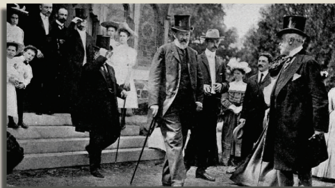
Witte leaving the peace service.