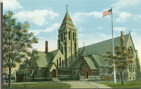
Interior and exterior views of Christ Church where a service of Thanksgiving was held after the treaty was signed.