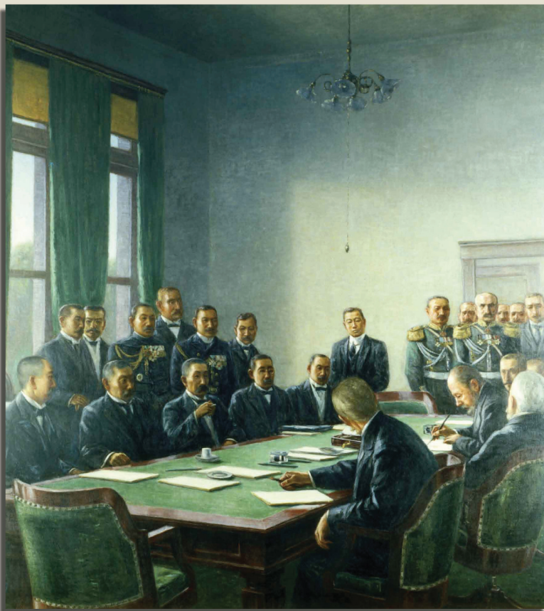
Witte signs treaty as Komura looks on. The Portsmouth Peace Conference by Ikuonosuke Shirataki.