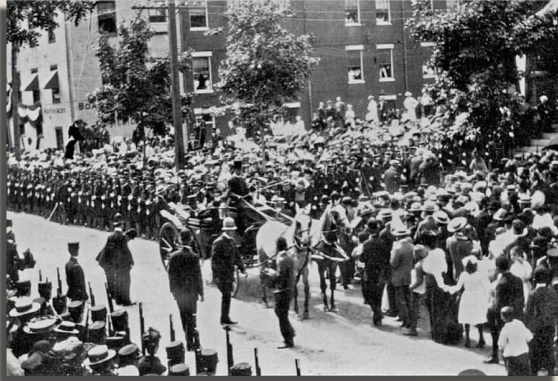
New Hampshire National Guardsmen were on duty as a crowd gathered outside the courthouse to welcome the peace envoys.

the Portsmouth's crowded streets to the courthouse. The New York Times reported, "The sidewalks were altogether too narrow to accommodate the crowds and the main streets were jammed from curb to curb. City women in beautiful gowns hurried through the mud in the streets and farmers rubbed elbows with spruce Bostonians." Women in charming costumes, the Times said, were very much in the majority.