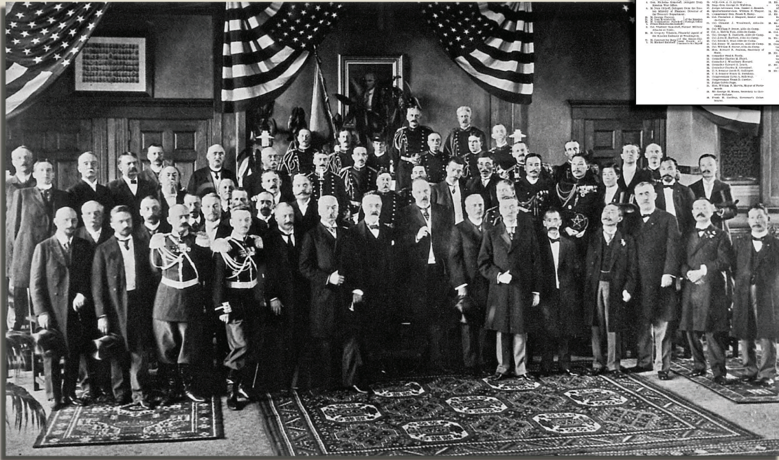
Perhaps the most famous photograph of the treaty events is this group view of both delegations along with New Hampshire Governor McLane and other local and state dignitaries.