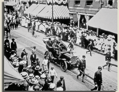
Local people in their Sunday best lined the streets of Portsmouth watch the parade of dignitaries.