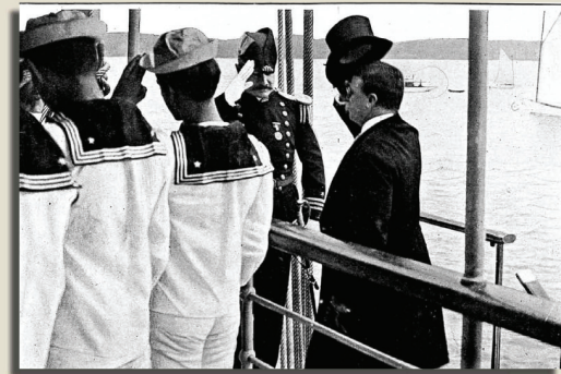
President Roosevelt Boards the Mayflower. Harper's Weekly.

Careful to maintain his neutrality, Roosevelt offered a toast for which he would not accept a reply, "I drink to the welfare and prosperity of the sovereigns and people of the nations whose representatives have met one another on this ship. It is my most earnest hope and prayer, in the interest not only of these two great powers, but all of civilized mankind, that a just and lasting peace may speedily be concluded between them." With that, the delegates left for Portsmouth.