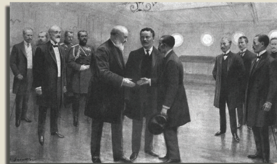
President Theodore Roosevelt introduces the Russian and Japanese delegations.